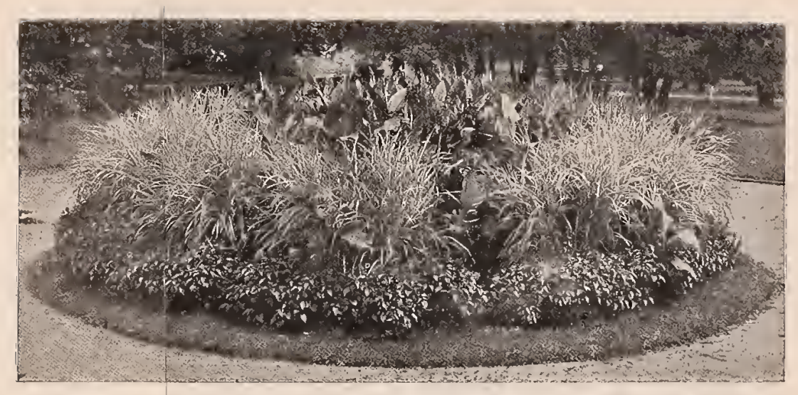
Above-An effective bed of Carnas, Dwarf Salvia, and ornamental grass.

We have extra trucks ready to deliver for Memorial Day but it will help greatly if you let us have your order as early as possible.